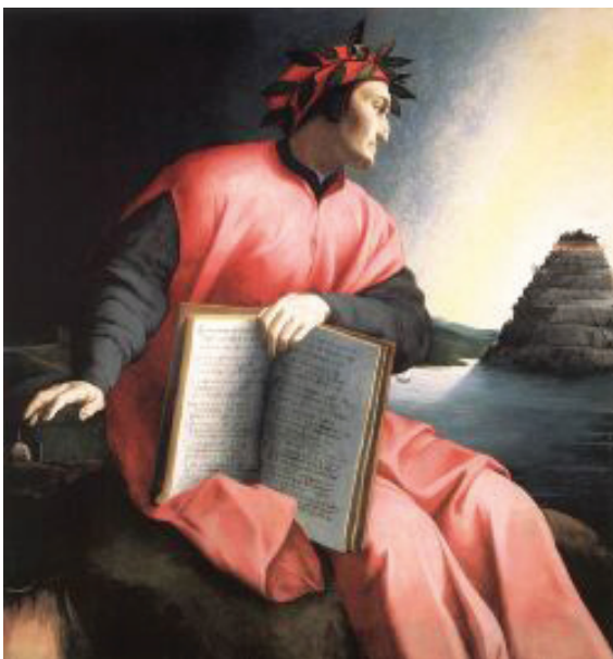
Dante Alighieri (1265 - 1321), Poet